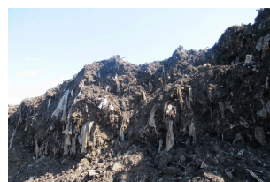
Bags visible in curing compost pile

Please consider using brown paper bags or cardboard liners instead of "compostable" bags.