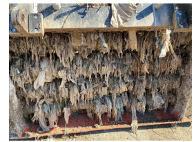
Bags tangled in grinder