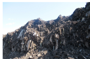
Bags visible in curing compost pile

Please consider using brown paper bags or cardboard liners instead of "compostable" bags.