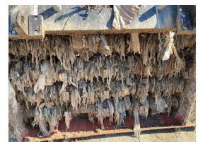
Bags tangled in grinder