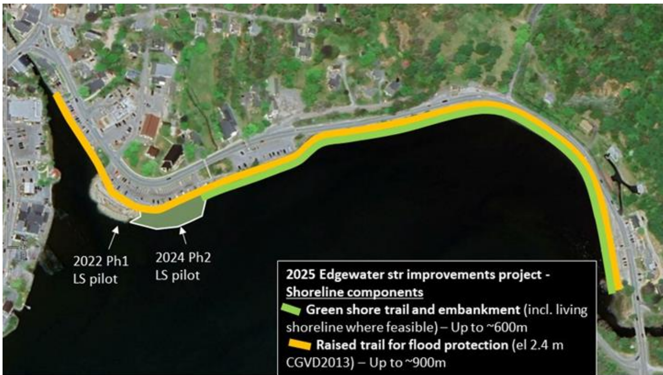
Figure 1: Shoreline Protection Phasing

Engineering of phase 2 is currently underway and will include a 100 m extension to Phase 1 which may be combined with this project. As part of this work a geotechnical program covering the entire 900 m length of shoreline to be protected was completed in January 2024 and will be used to support future design of shoreline protection and multiuse trail.