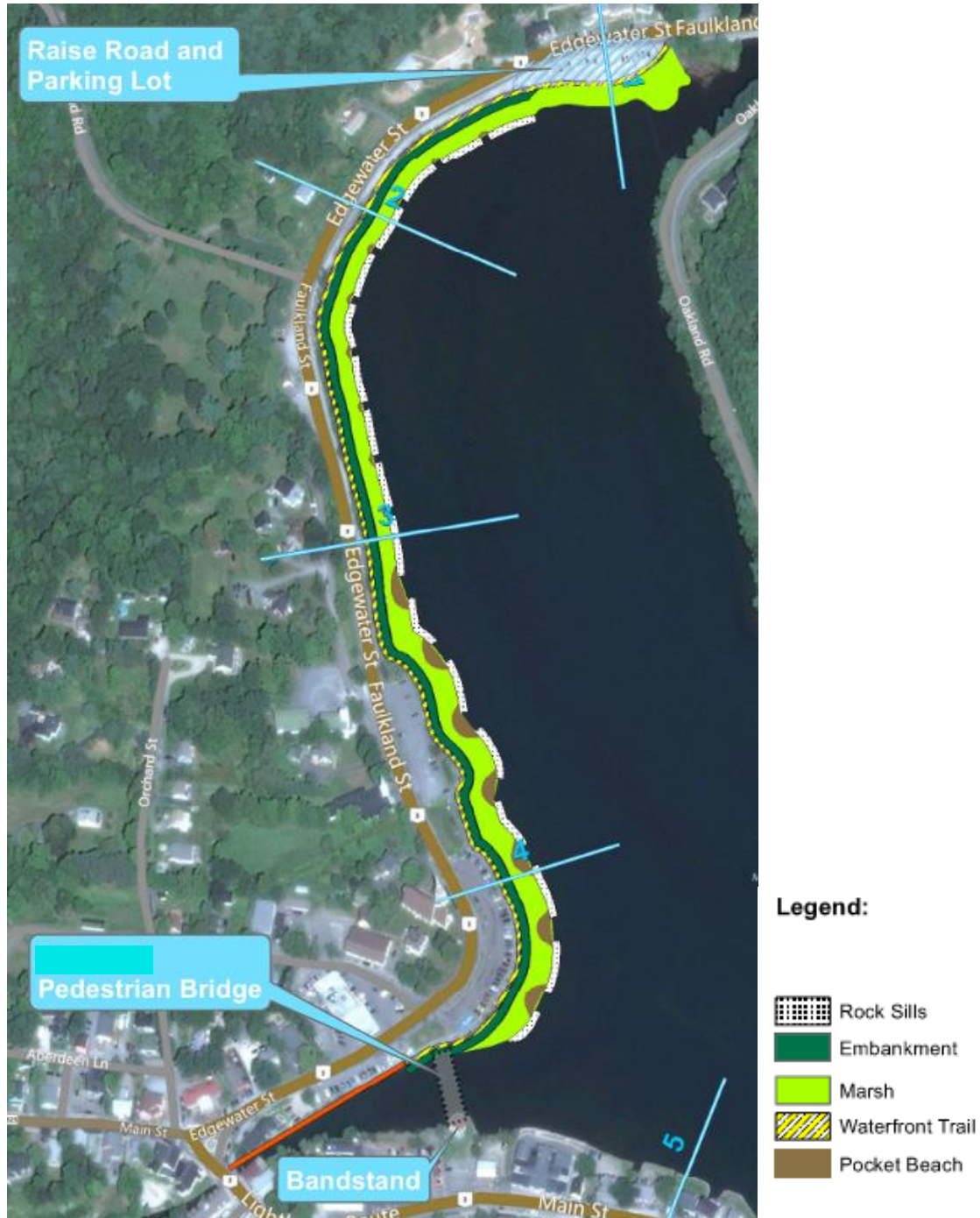
Figure 2: Concept Plan of Trail

2 shows the proposed trail and location of the pedestrian bridge. Figure 3 shows typical multiuse trail and shoreline protection cross section. Both figures were taken from the 2016 CBCL report.