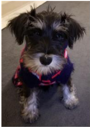
Sophie Biebesheimer is wearing Town of Mahone Bay 2020 Dog Tag #001

Does your dog have their 2020 Town of Mahone Bay Dog Tag? FREE Dog Registration is mandatory in Mahone Bay every year.