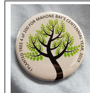
Congratulate your neighbours that you see with one of these participant buttons!

100 Trees: 100 years We are so pleased to see the new trees being planted around Town – 20 trees already! Thank you to everyone who has participated.